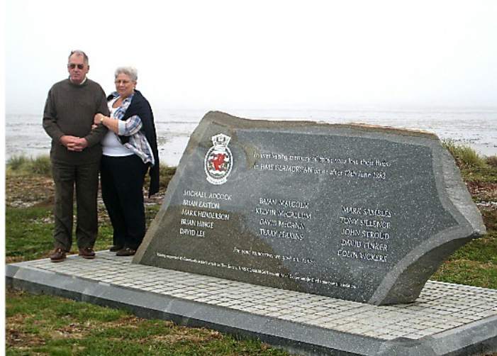
HMS Glamorgan Memorial Inauguration Hookers Point Falkland Islands Feb 2011