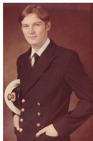
Deck Cadet 1980