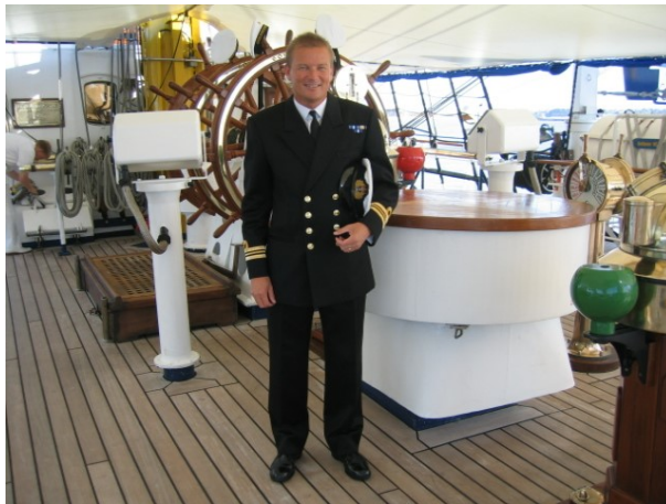
Lt Cdr RN, Gorch Fock 2004