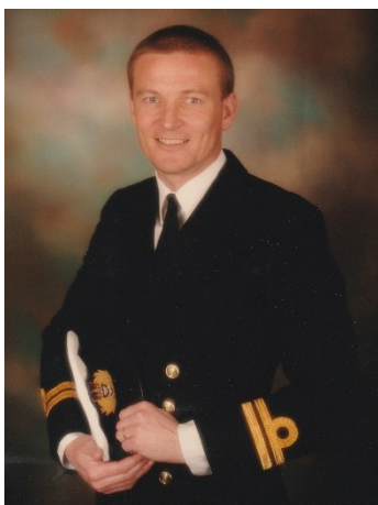
Lt RN 1986