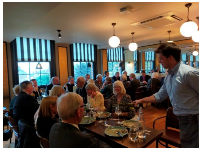
Lunch at Cote Brasserie