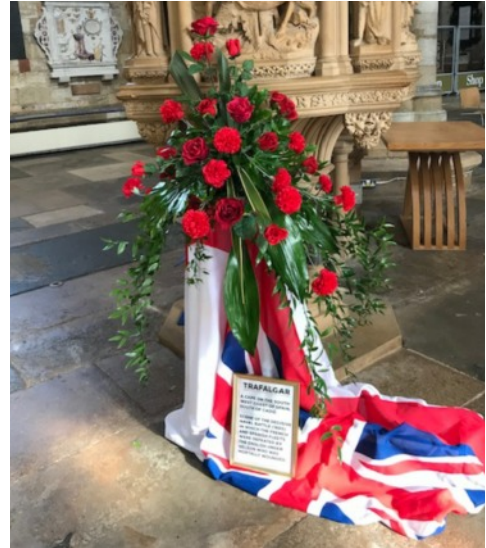
A little over £300 was raised for RN and RM charities