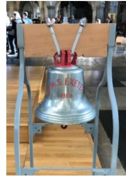
The Service began with seven bells rung on HMS Exeter's bell