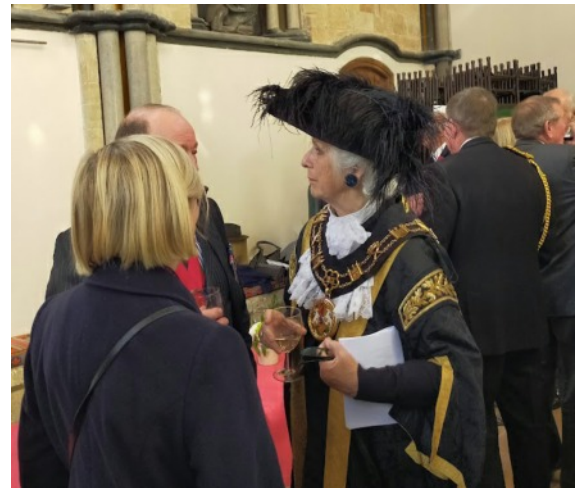
The Reception in the Cloisters