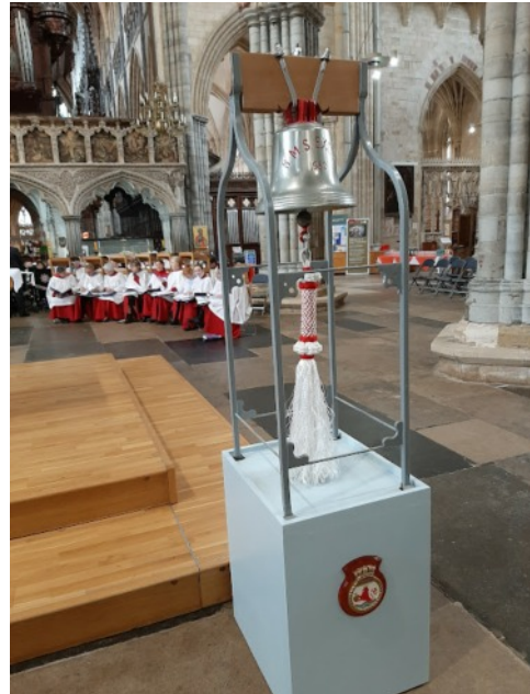
HMS Exeter Bell